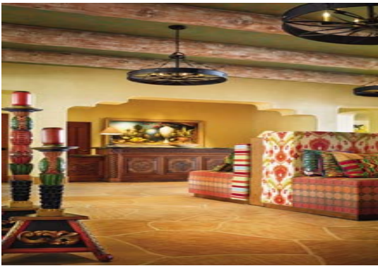
The Perfect Desert Getaway